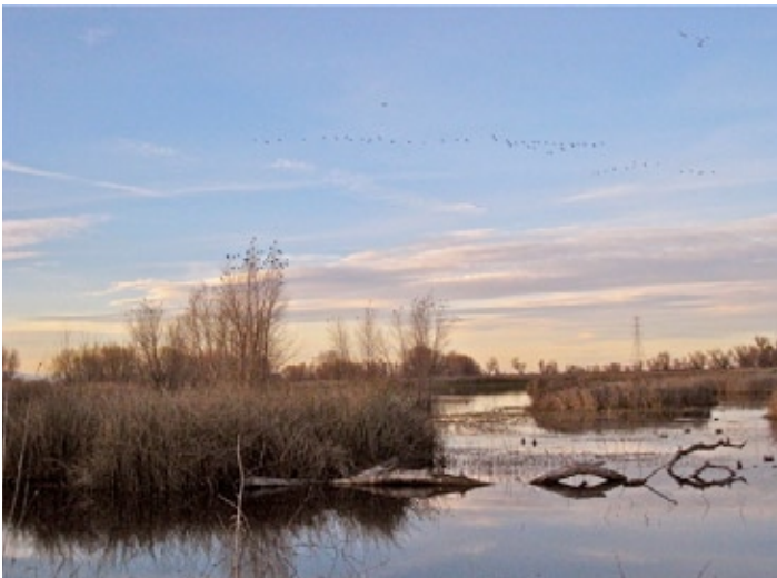
Pacific Flyway - continued from page 2

We did not visit Gray Lodge, a California refuge, due to lack of time, but it too has an auto tour. We also drove past Delevan Refuge, part of the complex, but with only roadside viewing, it offered little opportunity. One roadside sighting was special: hundreds of White-faced Ibis feasting in a shallow pond as we drove east to Colusa.